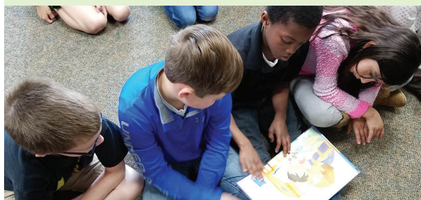
Second grade students explore a brailled children's book.