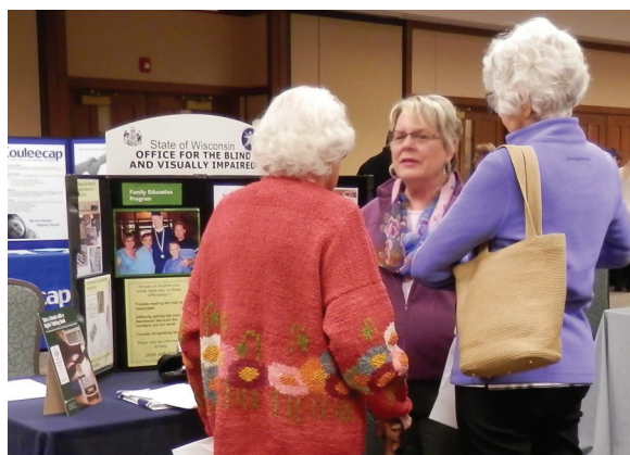
An exhibitor talks with Low Vision Fair attendees.

The November webinar gave registrants a tour of the new learning environments in the Sharper Vision Store. It also featured several magnification options and the new OrCam glasses. About 110 people participated in the 2017 webinars. Find upcoming webinars online at wcblind.org or view past webinars on the WCBVI YouTube channel.