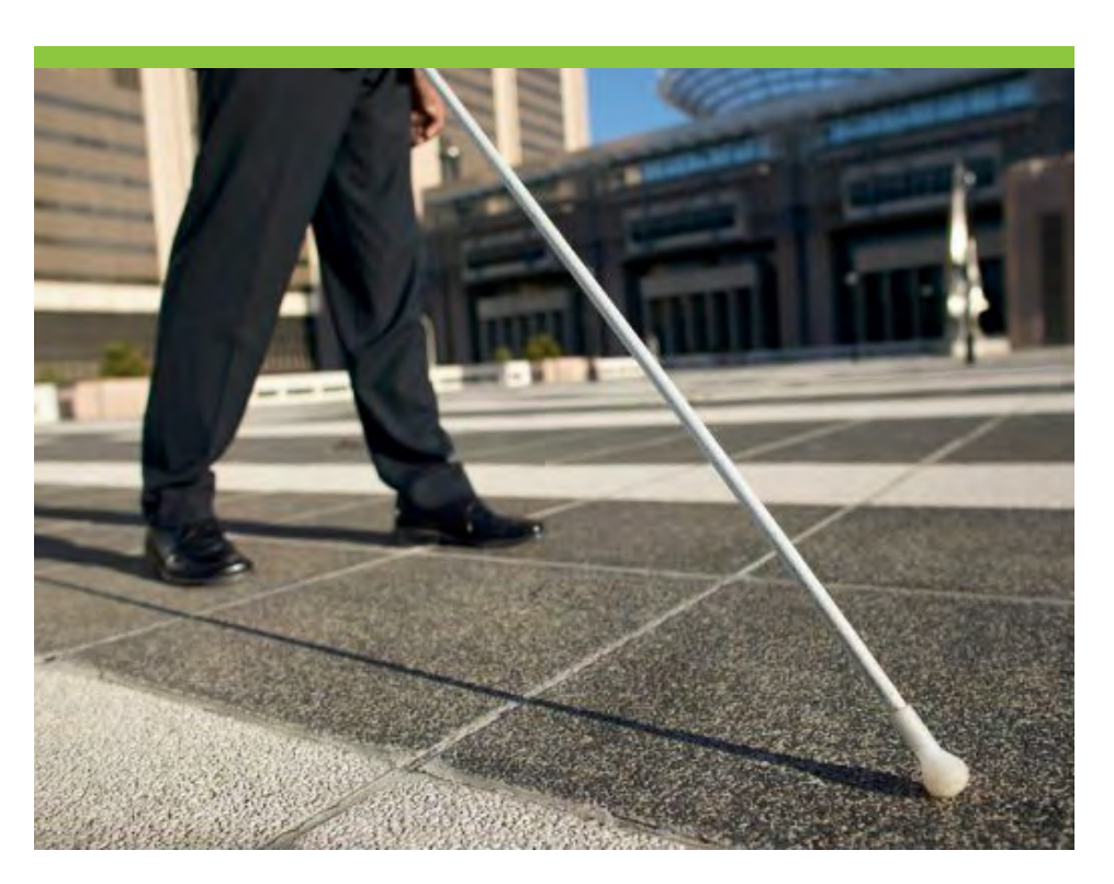
A person using a white cane to navigate a city sidewalk.

A white cane provides many benefits. Cane users can navigate both familiar and unfamiliar places without relying on a sighted guide to accompany them. They can safely explore their surroundings and make mental maps of walking routes, especially