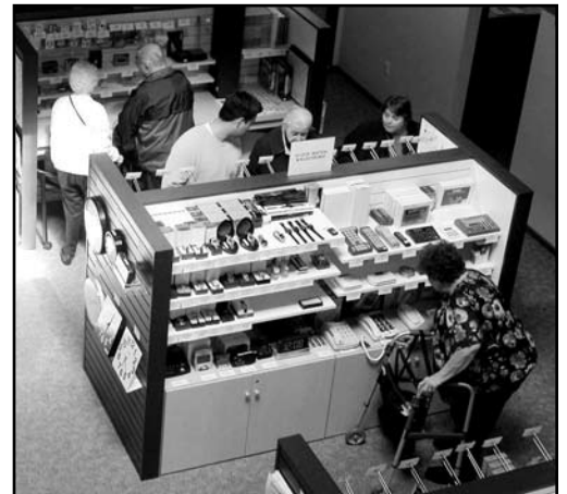
The Sharper Vision Store is open Monday-Friday from 8:00 am until 4:30 pm. Call direct at 608-273-8100 or toll-free 1-800-783-5213.

These exciting innovations were accomplished with one goal in mind: to provide the services necessary to meet future needs. We are pleased to welcome you to the Sharper Vision Store.