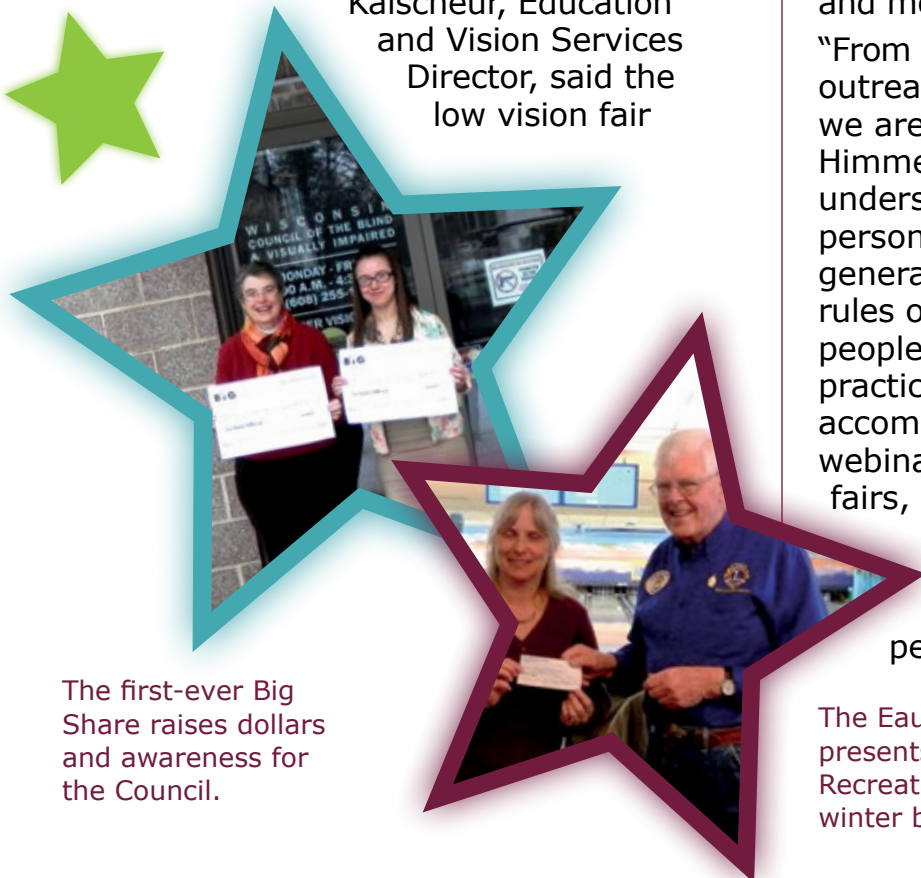
The first-ever Big Share raises dollars and awareness for the Council.