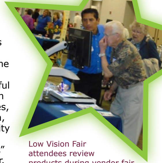
Low Vision Fair attendees review products during vendor fair.