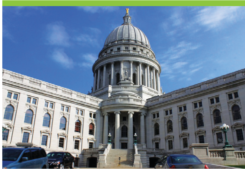
The Wisconsin State Capitol.

Advocacy is more than something to do at Legislative Day or when a community issue arises. It is important to bring awareness to issues people who are blind or visually impaired face, and work continuously to make communities more inclusive. Here is a checklist of some tasks you can tackle in 2020 to keep advocacy top-of-mind throughout the year.