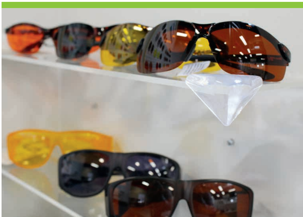
Close-up of sunglass frame and filter options on display at the Council's Sharper Vision Store.