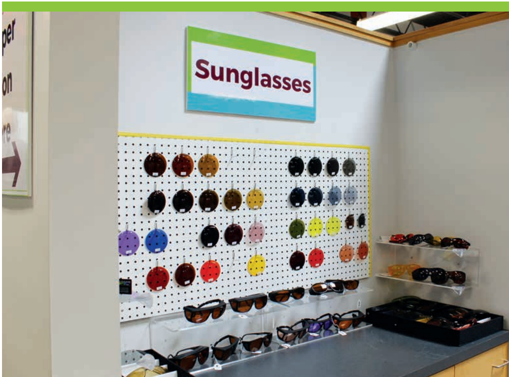
The sunglass display at the Council's Sharper Vision Store.

fit over glasses and others can be worn without glasses. And of course there is a mirror so you can check how you look in each frame.