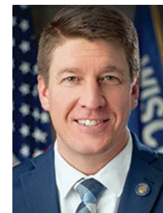
Sen. Eric Wimberger R-Green Bay