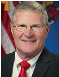
Sen. Howard Marklein R-Spring Green