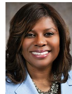
Sen. LaTonya Johnson D-Milwaukee