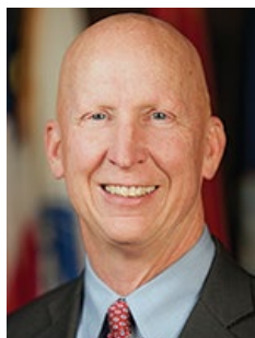
Sen. Duey Stroebel R-Saukville