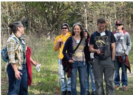
Birding by Ear

It was a busy spring, with three great educational events taking place in May. We held our Advocacy Day event to help people across the state gain the tools to work with local leaders on the issues that matter to them. Birding by Ear saw us join forces with the Southern Wisconsin Bird Alliance (formerly Madison Audubon) and new partner Aldo Leopold Nature Center to show how sound can be just as important in birding as sight. And we returned to Brix Cider in Mount Horeb for Dining in the Dark, where diners donned blindfolds to experience a three-course meal focusing on senses other than vision.