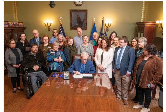
Gov. Tony Evers signing Steve's Law into the state statutes.