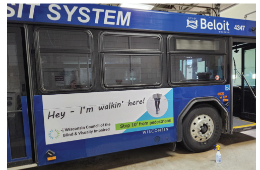
Our Pedestrian Safety Month ad on the side of a Beloit bus.

In November, we once again opened our doors to the community for our annual Gallery Night event.